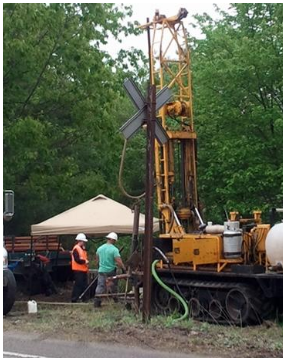
Drilling test borings for the design of the BFRT bridge over Great Road in Acton this May. Note the old railroad crossing signal in the foreground.