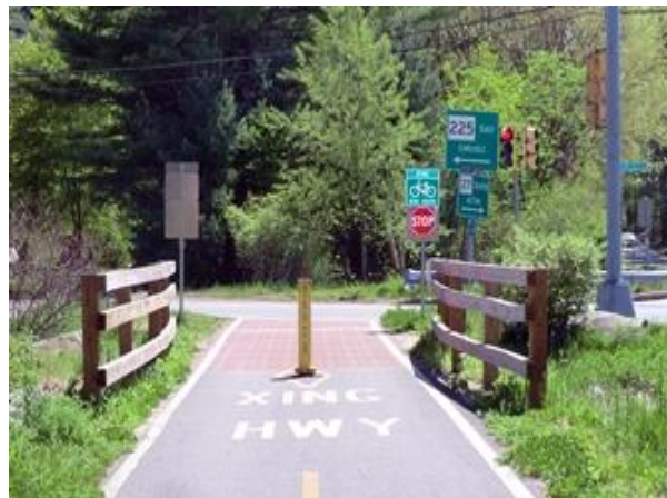
Current southern terminus of the Trail Trail users are champing at the bit for the construction of the next five miles through Acton.

Almost $24 million in construction funds for Phases 2A, 2B, and 2C have been recommended by the Boston Metropolitan Planning Organization (MPO) over the next four years. The Draft 2014-2017 Transportation Improvement Program (TIP) released in May for public comment is expected to be finalized by the end of June.