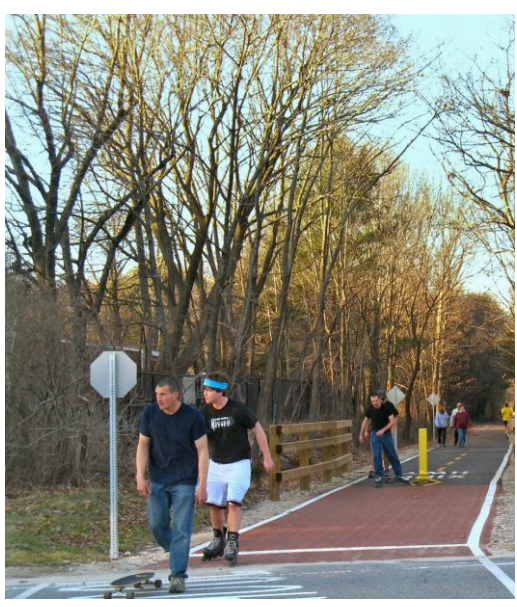
Folks using all manner of biped locomotion take advantage of the trail on a warm early spring day.

Funding for creating a parking lot at Sunny Meadow Farm, near Robin Hill Road, has been recommended by the Chelmsford Community Preservation Committee. Pending approval by Town Meeting, this lot will provide parking for both BFRT users and community gardeners. The Town would also use a 50-foot strip of land on which it has an easement to build a connecting path from the parking lot to the rail trail.