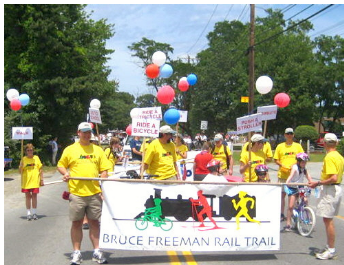
Rail trail supporters marching in Sudbury's July 4th parade received fervent applause from the crowds along the route