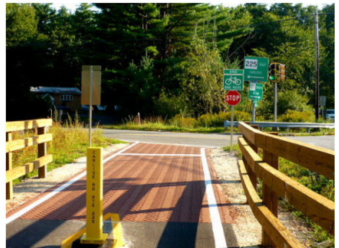
The southern end of the completed Phase 1 in Westford looking longingly toward yet-to-be-built portions in Carlisle, Acton, Concord, Sudbury & Framingham.